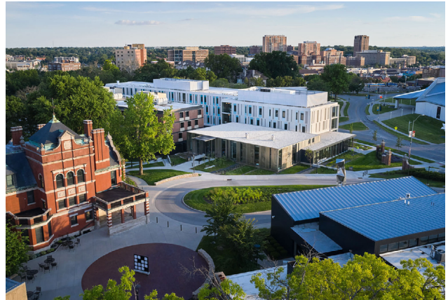
KCAI campus showing Vanderslice Hall, David T. Beals III Studios for Art and Technology, Rowland Commons, Café Nerman, and Wylie Dining.

In 2015, KCAI received a mysterious and amazing gift of $25 million. This generous donation has had a lasting impact on the institution, influencing its future in terms of funds, space and scholarships. Today, with 13 majors and a faculty of 120+ artists, KCAI stands as a clear example of how a substantial gift can empower students, equipping them with the tools and resources to bring their artistic visions to life.