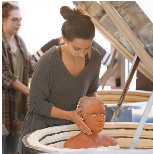
KCAI ceramics student lowers ceramic bust into on-site Richard J. Stern Ceramics Studio kiln.

KCAI is committed to values that enhance the learning experience. All full-time instructors are practicing artists, ensuring real-world insights. They prioritize personalized studios, tailor spaces to students' needs and encourage artistic freedom.