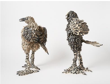
Izzy Parrish Workman Ceramics Freddie the Bird; Lady the Bird , 2022 ceramic