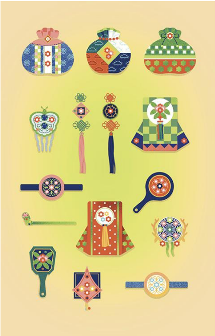
Esther Lee Graphic Design / Asian Studies Certificate Prosperous Items , 2023 (detail) digital print