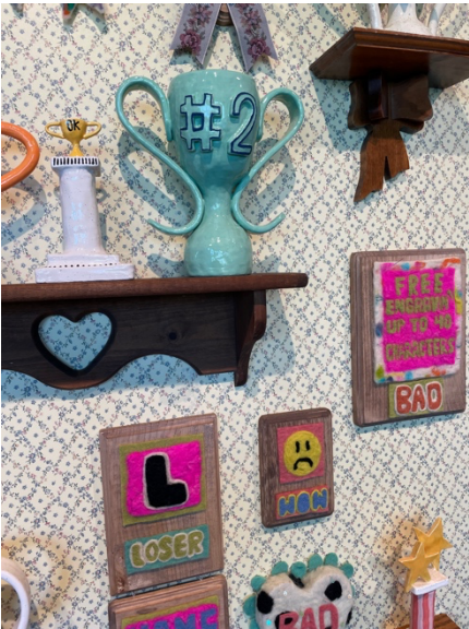
Riley Rouse Sculpture Proud of You , 2022 ceramic, felt, plywood, found objects