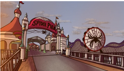
Diego Rancano Animation THE ONLY WAY , 2023 digital animation