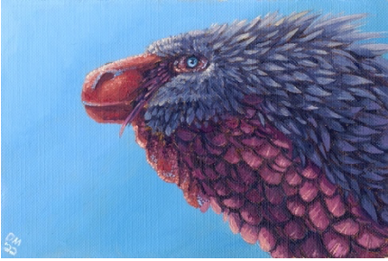
Dani Mays Illustration Selected Paleoart ("Acheroraptors", "Utauraptor Ostrommaysi", "Azhdarchids") , 2022 (detail) oil and graphite on paper